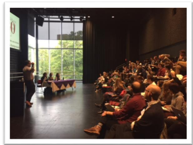
IPTD 30 th Anniversary Reunion and Symposium