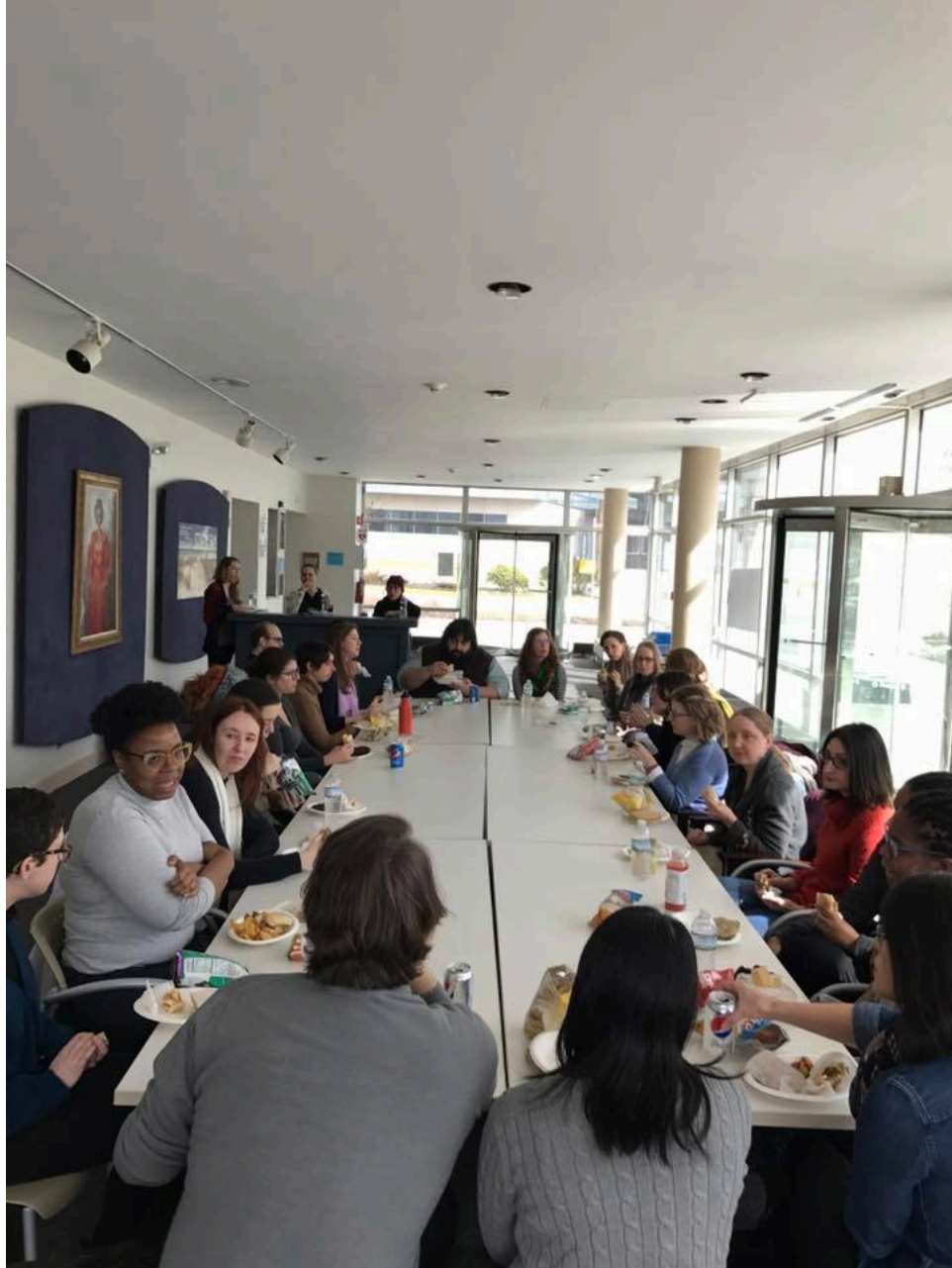
IPTD Applicant Weekend 2017